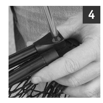
Remove hinge end screw