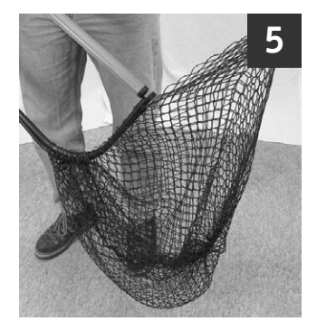
Slide netting off hoop Replace netting using reverse order of instructions Secure new netting with zip ties