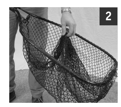
Reverse netting through hoop and remove zip ties