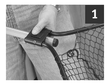
Hold the StowMaster<sup>™</sup> upside down