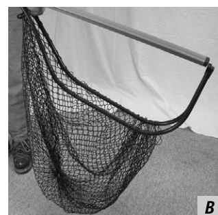
Push extension to meet hinge, allowing hoop to fold